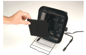
Replacing the filter is easy and economical.